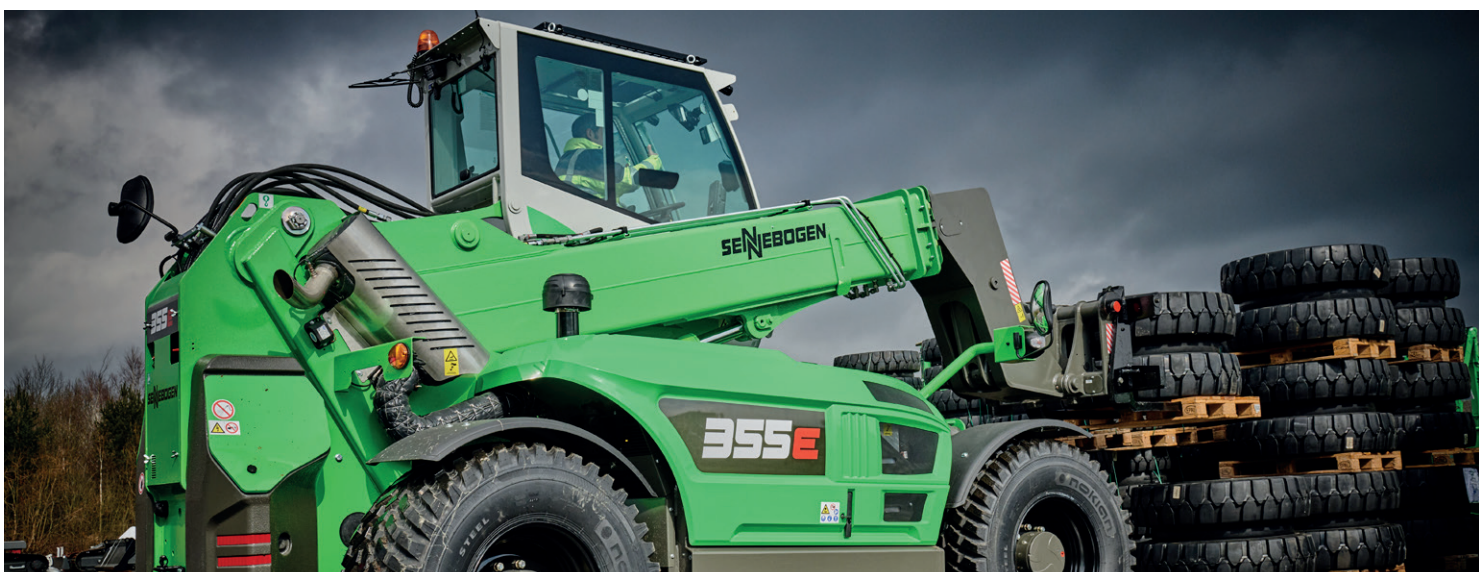
The new Telehandler 355 E from Sennebogen – good looks and first-class technology.

Either more torque for high lifting and pushing forces or faster driving speed. This solution optimally meets all requirements in materials handling.